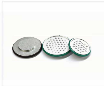
Specimen discs with cubic studs enable stable specimen mounting

The flat stem provides large contact surface for heat transfer and the ease of operation