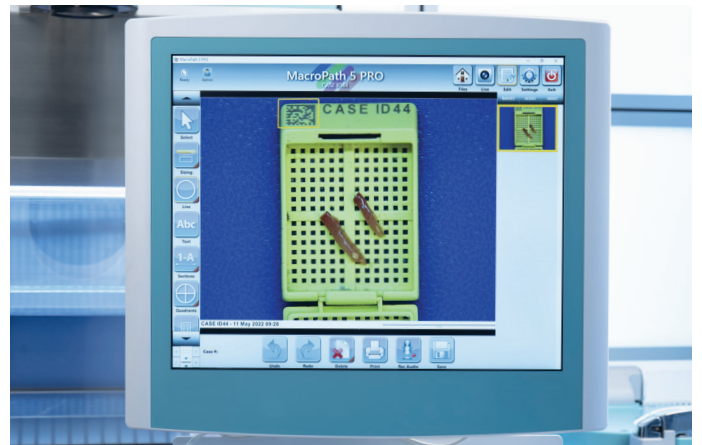
C-Scan reads the cassette's code, creates the respective case ID folder and takes a picture at a preset zoom.