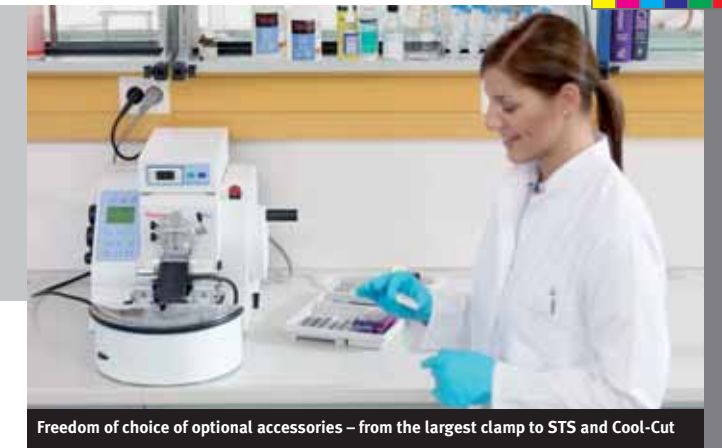
Freedom of choice of optional accessories – from the largest clamp to STS and Cool-Cut