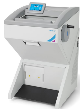
HM525 NX Cryostat