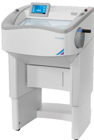
CryoStar NX70 Cryostat

Deliver high-quality results comfortably and efficiently with the HM525 NX cryostat, a high-performance routine cryostat with intuitive software and touch screen for simple, efficient operation. The HM525 NX cryostat offers reliability, advanced ergonomics and an intuitive interface.