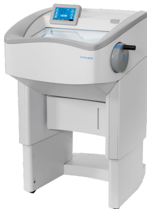
CryoStar NX50 Cryostat