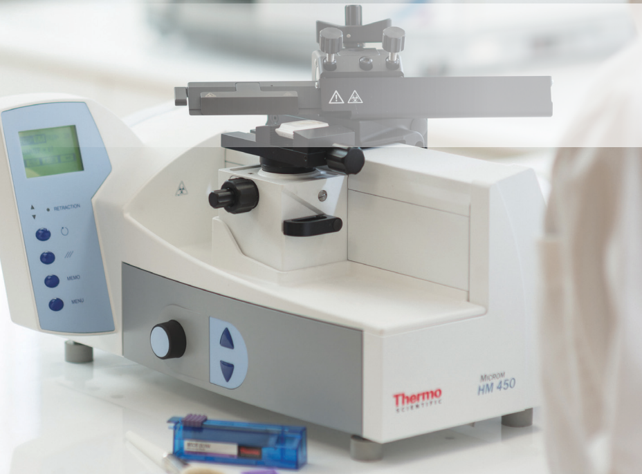
Thermo Scientific Microm HM 430/HM 450 Sliding Microtomes